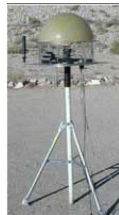
The ATAR system in the field uses telemetry data transmitted over UHF LOS radio and points its L-band video receive antenna at the broadcast source.